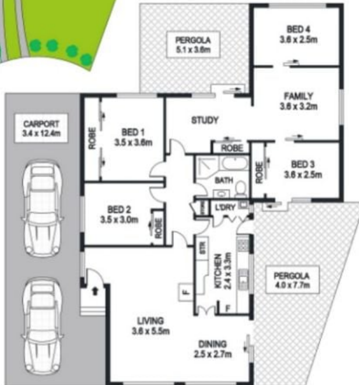
12 TYRONE PLACE, BLACTOWN