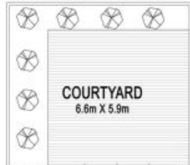
COURTYARD 6.6m X 5.9m